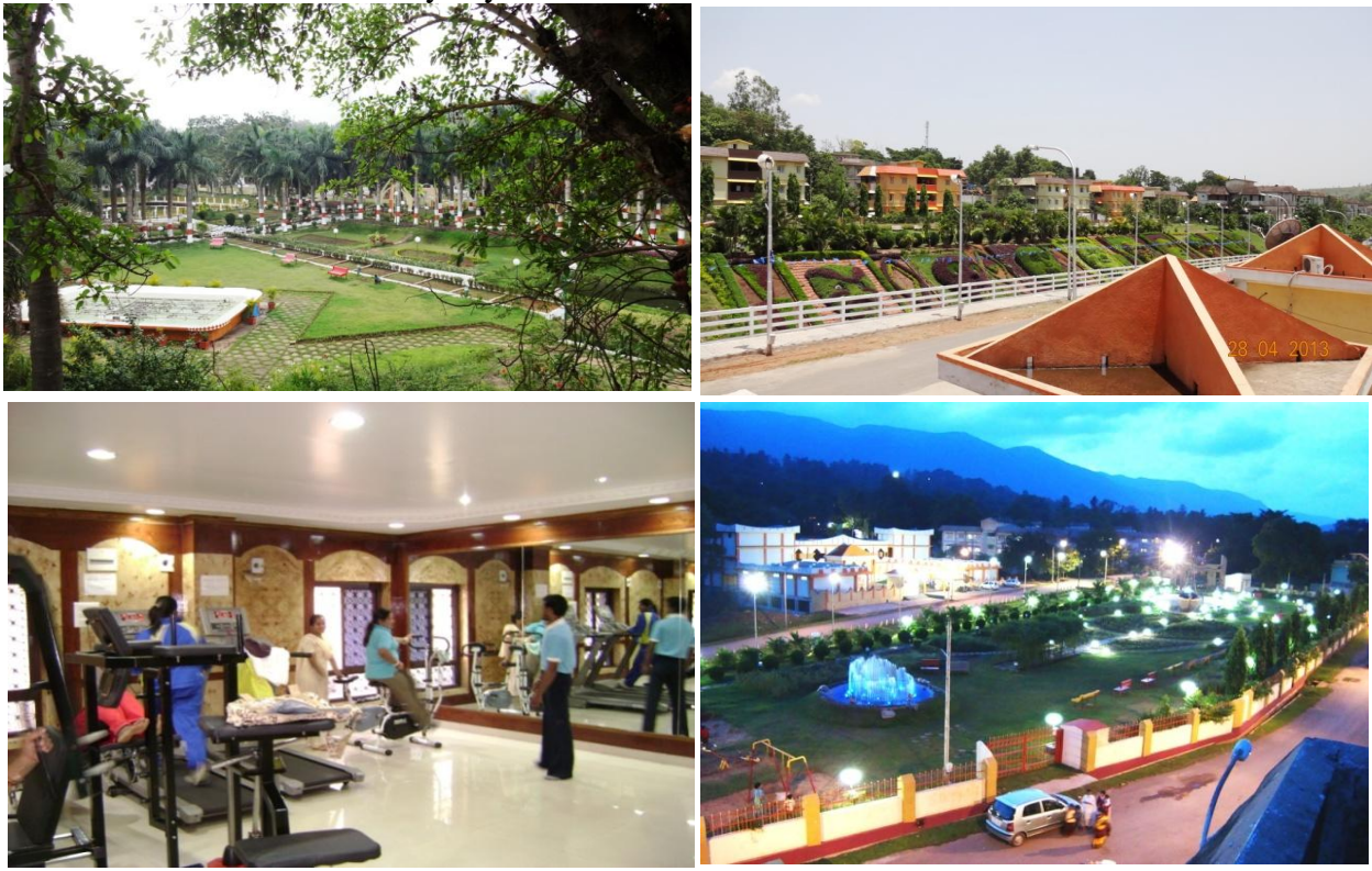
Serving Humanity is Serving Nation

Bacheli and Kirandul Townships at Bailadila Complex are located at the foothills of Bailadila hills surrounded by lush green forest and waterfalls. Bacheli is 30 km from Maa Danteshwari Temple Town / Dist. HQ Dantewada and 120 km from Jagdalpur which is commercial hub of Bastar and is well connected by road and rail to Raipur and Visakhapatnam. The nearest city Jagdalpur is connected by air to Raipur and Hyderabad. Nagarnar is 16 Km from Jagdalpur where a 3 MTPA capacity Greenfield Integrated Steel Plant is setting up by Government of India under Ministry of Steel. The company provides 2 BHK & 3 BHK accommodations with all amenities like 24 hrs water supply, electricity, telephone, security, pick up & drop facilities and supported by in-house maintenance. The company has high class townships with all amenities like Shopping Centres, Co-operative Stores, Cafeteria, Function hall, Cultural Associations, Banks, Officers Club with well equipped gymnasium, badminton court, Swimming Pool, Parks, CBSE schools like Kendriya Vidyalaya, DAV Public School up to XII std, ICSE school Prakash Vidyalaya.