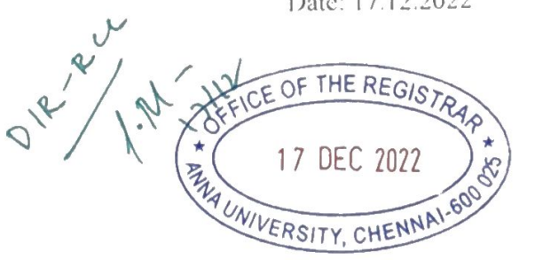
DIREC DIREC Institute for Ocean Management Anna University, Chennai - 600 025, India